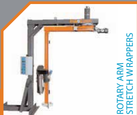
ROTARY ARM STRETCH WRAPPERS