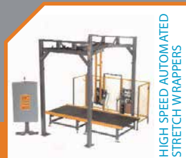
HIGH SPEED AUTOMATED STRETCH WRAPPERS