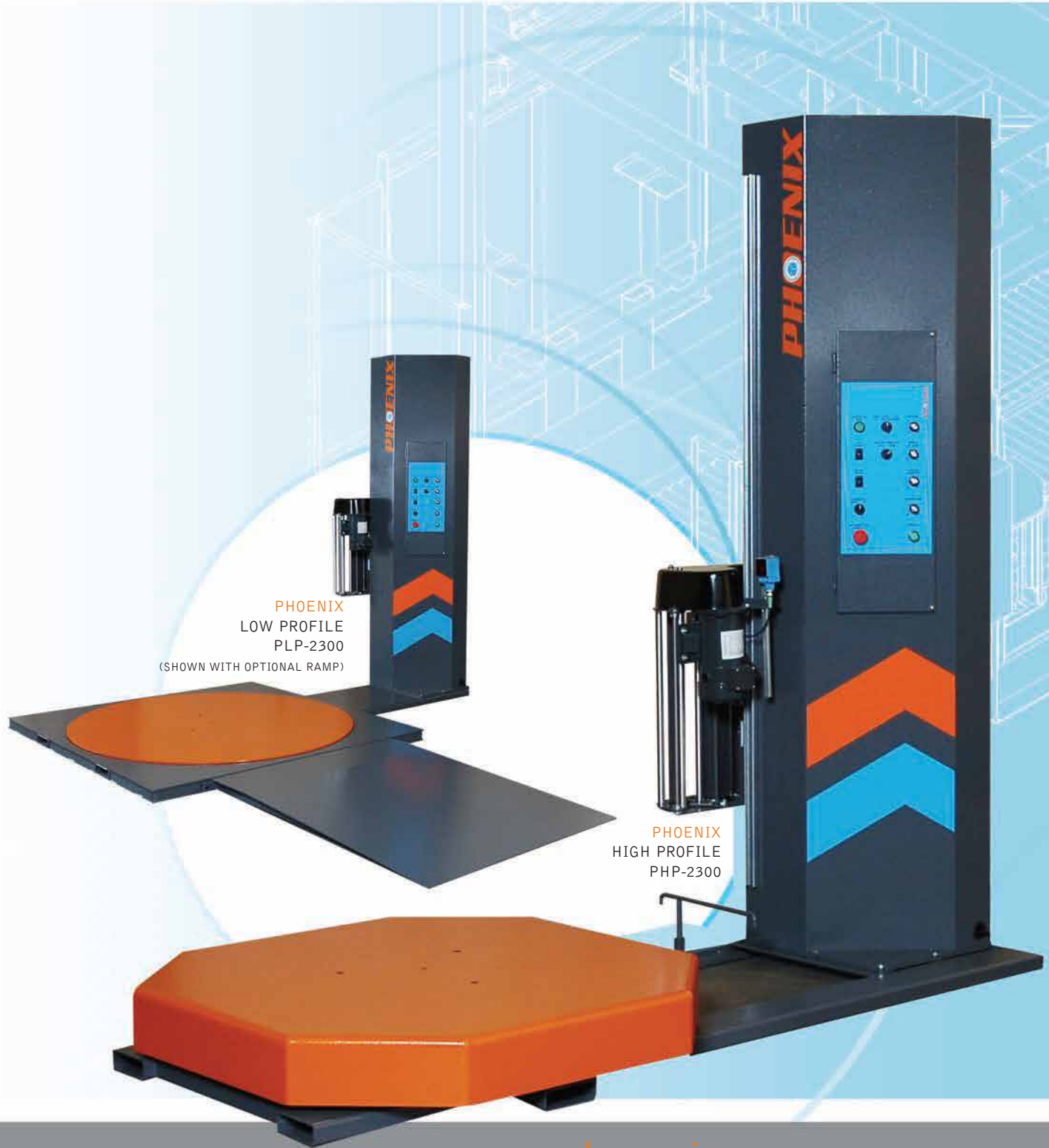
PHOENIX LOW PROFILE PLP-2300 (SHOWN WITH OPTIONAL RAMP)