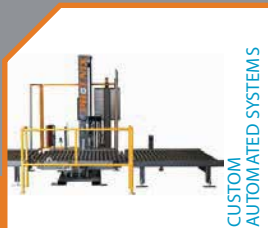
CUSTOM AUTOMATED SYSTEMS