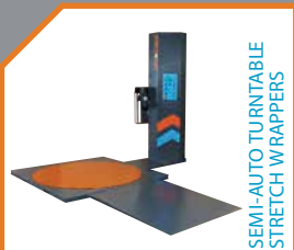
SEMI-AUTO TURNTABLE STRETCH WRAPPERS