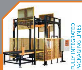
FULLY INTEGRATED PACKAGING LINES