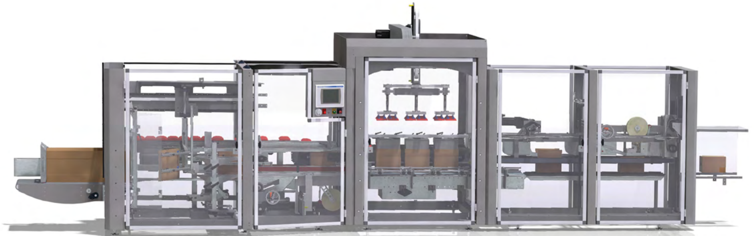
▲ TriVex® RL i pictured