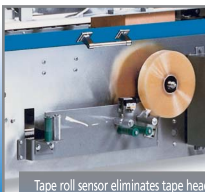
Tape roll sensor eliminates tape head re-threading.

The Super Pro 30T is equipped with features to eliminate wasted tape and to dramatically reduce lost production time for tape roll changes. First, both the top and bottom tape rolls are exterior mounted to allow easy access. Second, a "roll empty" sensor stops the sealer just as the end of the tape comes off the roll. The attendant simply replaces the roll, and attaches the new roll to the tail of the last roll.