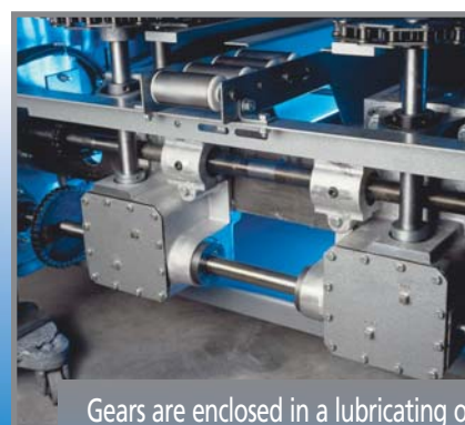
Gears are enclosed in a lubricating oil bath to eliminate wear from friction and increase machine life.

The main drive gear assembly is enclosed in a lubricating oil bath to eliminate gear wear. Sealed bearings and self-lubricated air cylinders never need maintenance. The automatic water eliminator prevents air valve damage caused by water in air lines. When routine maintenance or cleaning is necessary, the gull-wing doors swing out of the way to allow complete machine access.