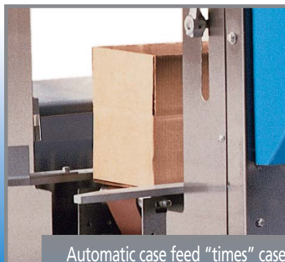
Automatic case feed "times" cases into the machine for proper spacing.

The design of the Super Pro 30T is attractive as well as functional. The sleek stainless steel frame won't rust and never needs painting. The clear, gull-wing doors are standard protection on the Super Pro 30T, not special order. They are electrically interlocked to stop the sealer when opened, allowing total access to the machine.