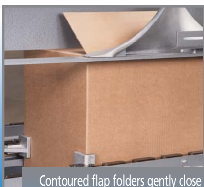
Contoured flap folders gently close the flaps at the score line to ensure square cases.

The cast aluminum flap folders are gradually contoured to fold the flaps at the score line then close them smoothly with no flap overlap. Even cases with poor scores are folded squarely.