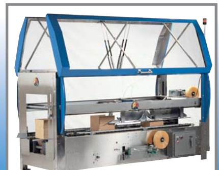
High visibility guards stop the machine when opened, and allow complete access to operating parts.