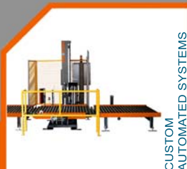
CUSTOM AUTOMATED SYSTEMS