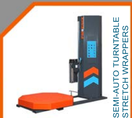
SEMI-AUTO TURNTABLE STRETCH WRAPPERS