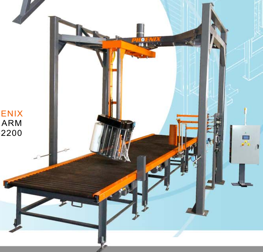
PHOENIX CONVEYORIZED ROTARY ARM PRTA-2200