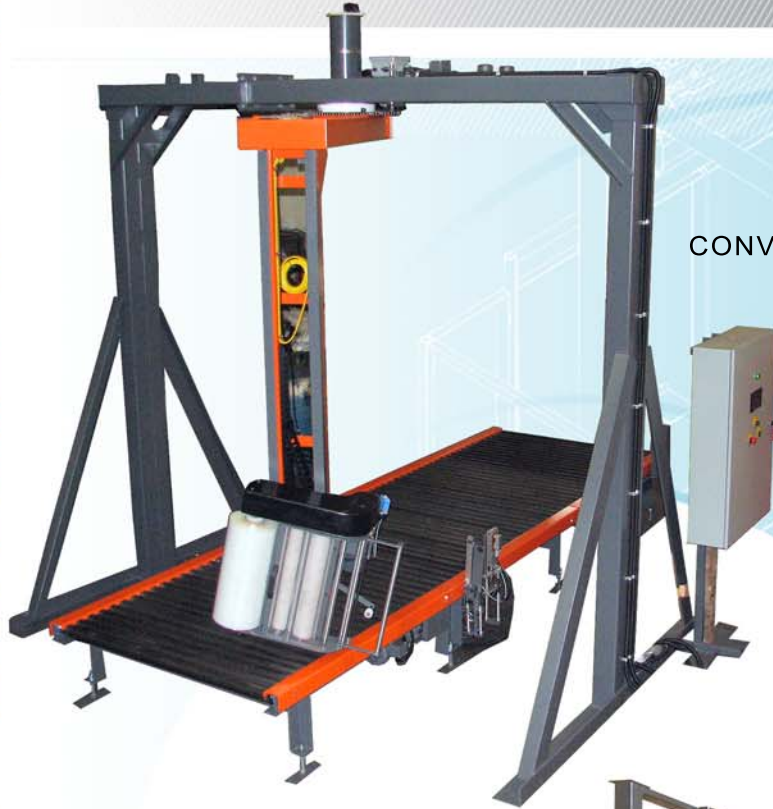
PHOENIX CONVEYORIZED ROTARY ARM PRTA-2150