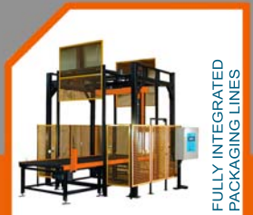
FULLY INTEGRATED PACKAGING LINES