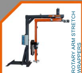
ROTARY ARM STRETCH WRAPPERS