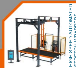
HIGH SPEED AUTOMATED STRETCH WRAPPERS