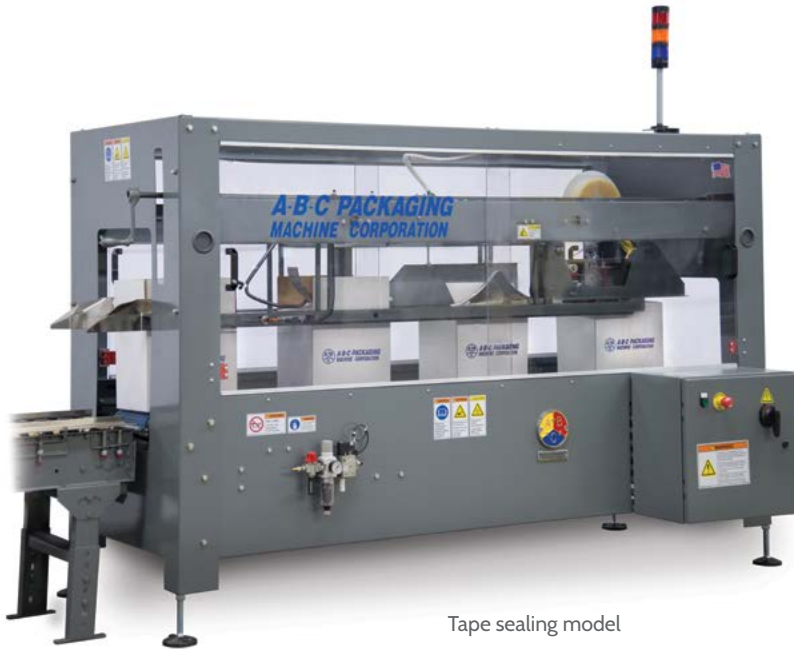
Tape sealing model