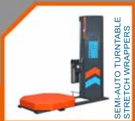
SEMI-AUTO TURNTABLE STRETCH WRAPPERS