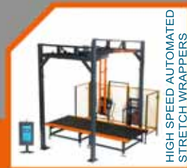
HIGH SPEED AUTOMATED STRETCH WRAPPERS