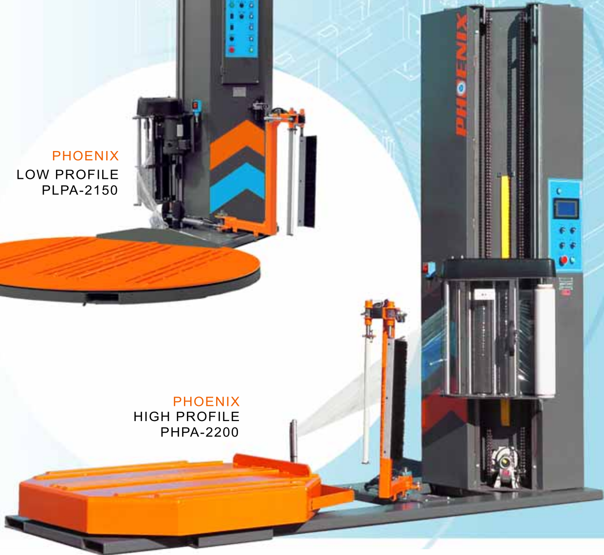
PHOENIX HIGH PROFILE PHPA-2200