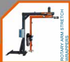
ROTARY ARM STRETCH WRAPPERS