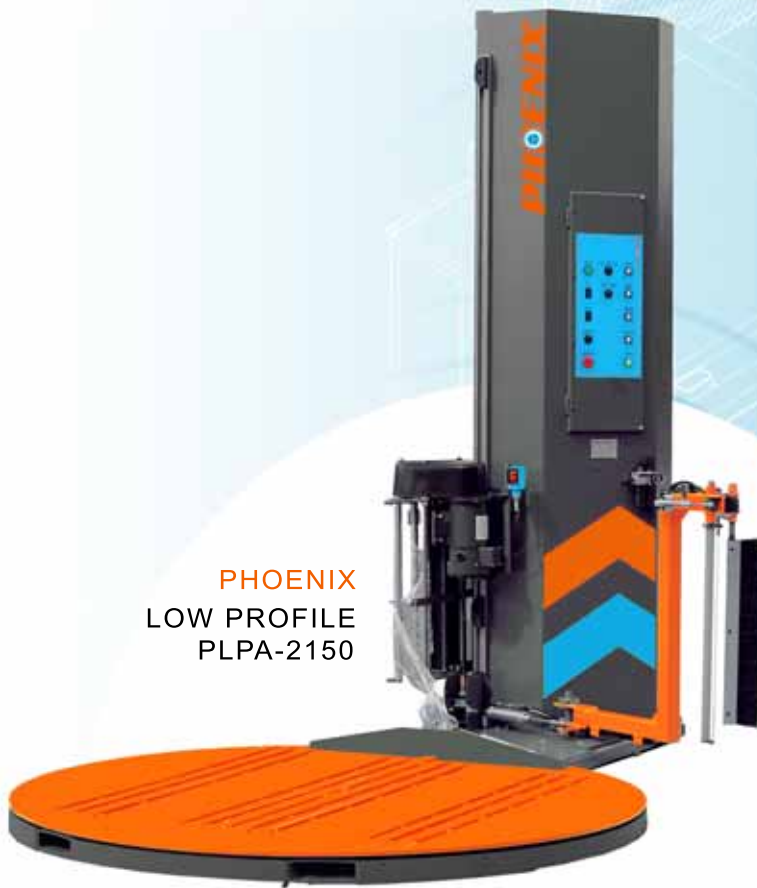
PHOENIX LOW PROFILE PLPA-2150