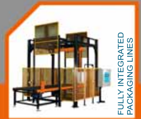
FULLY INTEGRATED PACKAGING LINES