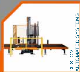
CUSTOM AUTOMATED SYSTEMS